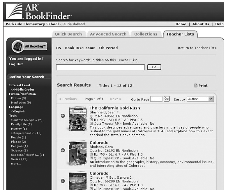
A Screen Shot of AR BookFinder ( www.arbookfind.com ) AR BookFinder is the free online search tool that makes it easy for parents and students to search for just the right book!